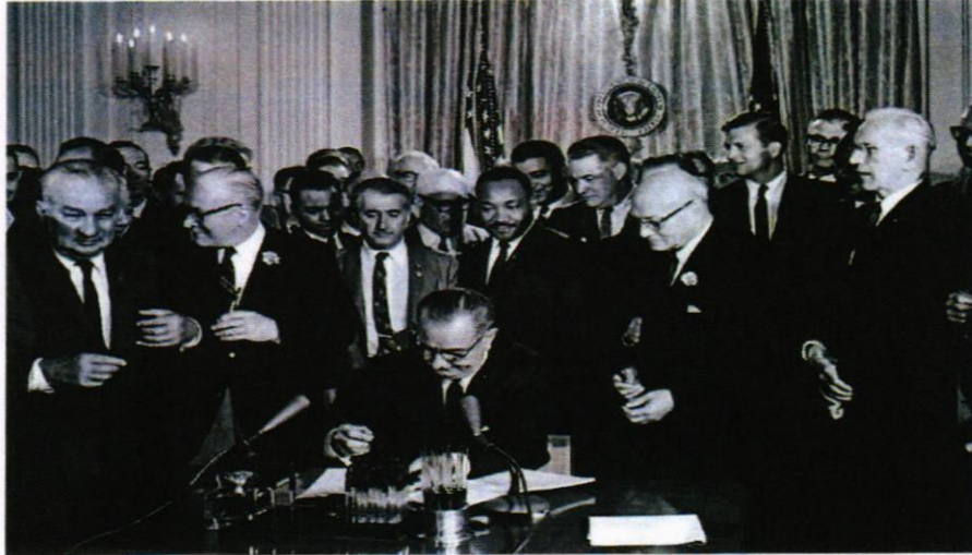
President Lyndon B Johnson signing the Civil Rights Act of 1964